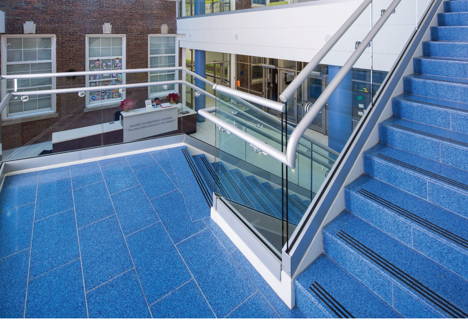
Phoebe Hearst Elementary | Sacramento, CA | Precast Epoxy Terrazzo Tread and Risers